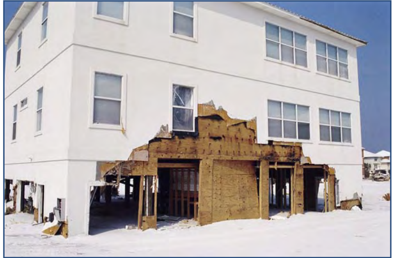
Siding on the non-breakaway portions of this elevated building was extended over breakaway enclosure walls and was damaged when breakaway walls failed under flood forces.