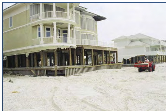
Breakaway walls that failed under the flood forces of Hurricane Ivan.

This Home Builder's Guide to Coastal Construction recommends the use of insect screening or open wood lattice instead of solid enclosures beneath elevated residential buildings.