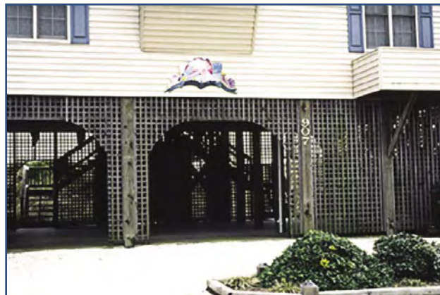
Open wood lattice installed beneath an elevated house in a V zone.